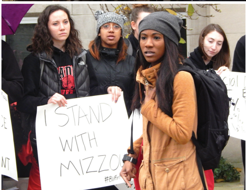
Students gather Monday in front of Bradley Hall as part of a solidarity protest to support students at Mizzou and to advocate for diversity on campus.